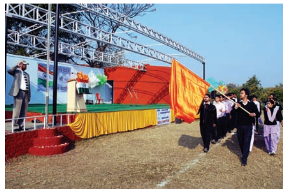
Parade by paramedical students