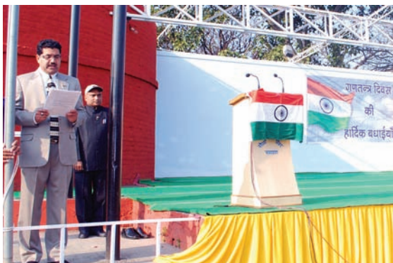
VC reciting the oath