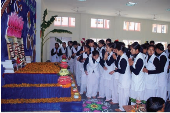
Nursing students seeking blessings