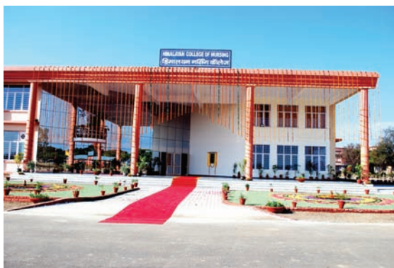
New building of Himalayan College of Nursing