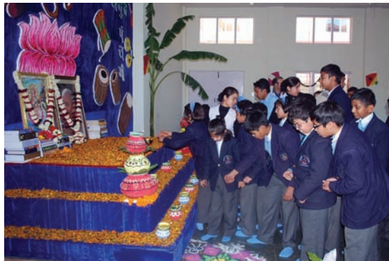
Children of the campus seeking blessings