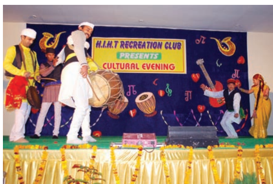
Staff performing Garhwali song and dance