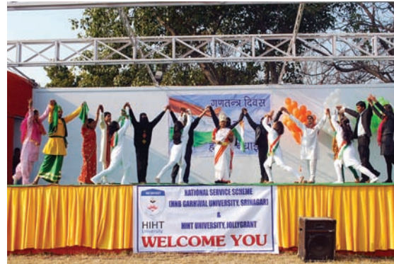
Patriotic skit by nursing students