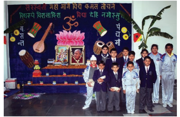
Children of the campus seeking blessings