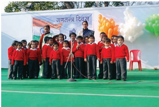
Vidya School children singing patriotic song