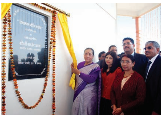
Governor Uttarakhand unveiling the foundation stone