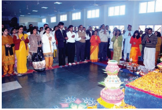
Faculty of HIHT worshipping goddess Saraswati