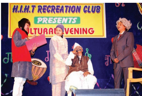
Skit performed by staff