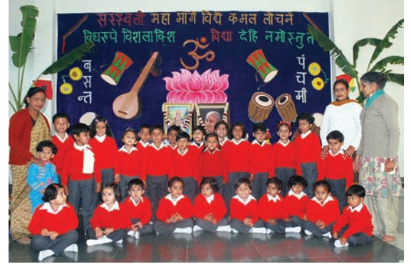
Children of Vidya School who sang Saraswati Vandana