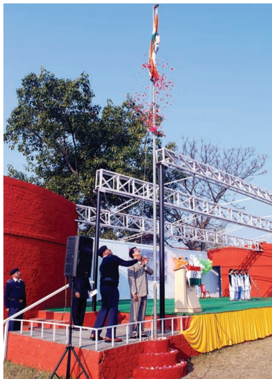
VC hoisting the national flag