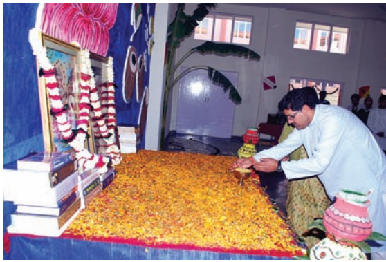
VC lighting the lamp to Saraswati Maa