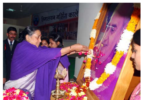
Governor Uttarakhand paying homage to Swami Rama

The program ended with a vote of thanks.