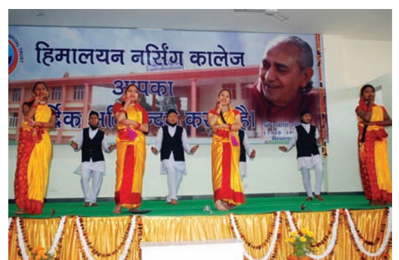
Cultural performance by nursing college students