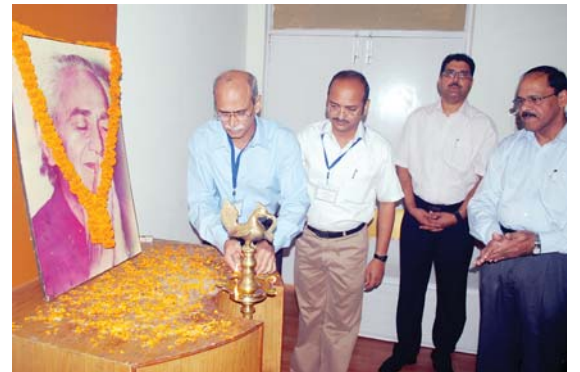
Dignitaries lighting the lamp

FCCS is an international structured course accredited by the Society of Critical Care Medicine, USA and was organized in the state of Uttarakhand for the first time.