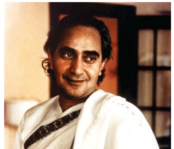
HH Swami Rama

Yoga teaches you how to be and gives something that religion does not provide. Yoga is an exact science that helps you to know yourself on all levels—body, breath, mind and spirit. From your childhood onward your education has led you to examine and verify things in the external world, which is constantly changing. Your education has not helped you to become aware that there is another reality within that never changes. You have to learn to accommodate and understand both realities and the whole structure of life, including the known and the