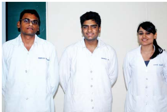
Winners of English debate