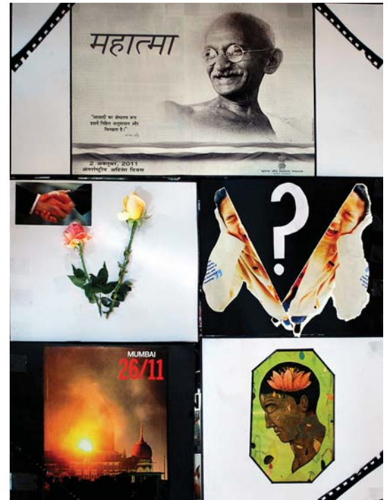
Best collage on topic "peace"