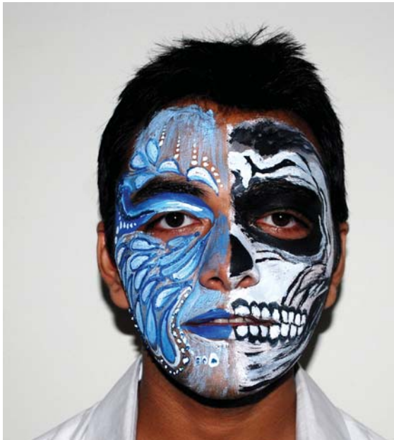
Best face painting, (Literary Events 2011)

She was just a lil girl Born with an ugly face "Prayer will make you pretty, child" Her grandma used to say. She didn't believe it, but she did pray. In school there were girls Pretty as the sun Boys would bring them chocolates She didn't even get one. But when she came home and cried Her mother kissed her cheek "I love you," her mother said, "and that makes you pretty to me." She met a guy who thought the same "You're beautiful" he said She refused to believe that but loved him back. A wedding: white flowers and cake. She had a home Full of laughter and joy Tears, bruised knees, first loves. A harried life she lived But never did she forget to pray A few tears of sorrow she shed Many tears of joy. She love her children And loved her man She just didn't love her face. Until one day her children grew up And flew away from her nest Happy for them, yet sad too She sat alone and prayed. Her husband came then And kissed her cheek It was now withered and old "You're beautiful" he said She laughed and said "no." He took her by the hand And showed her a mirror And lo, she saw a kindly woman Smiling back at her. She looked up surprised And met his eyes "How could this be?" she asked. He smiled and said, 'tis a life well lived That shows on your face. Joy and laughter Kindness of heart Prayer and love 'Tis this, the face reflects.