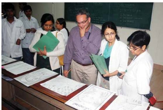
Faculty judging the event