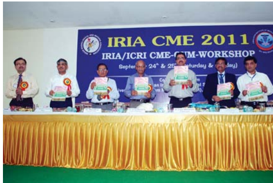
Releasing the souvenir