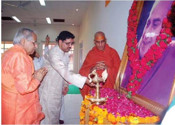
Lamp lighting by Chief Guest, Chanceller and VC