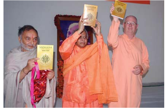
New title being released