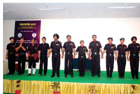
Performers of skit during conference