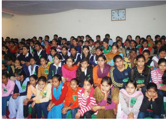
Swami Rama Scholarship recipients