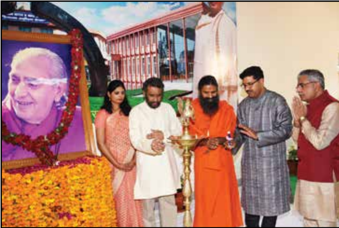
Lamp Lighting with Chief Guest Yog Guru Baba Ramdevji