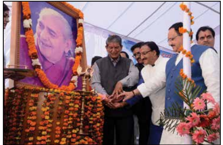
Lamp Lighting with Chief Guest Shri J.P. Nadda

Speaking on the occasion, Shri Harish Rawat said that the opening of the Cancer Research Institute at Jolly Grant has eased the burden of the cancer hospitals in the metro cities besides adding to the comforts of the cancer patients within Uttarakhand and its adjoining states. The modern treatment facilities are now available to them with ease and at affordable cost at the Cancer Research