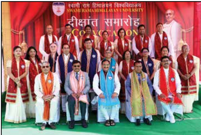
Dignitaries on the dias with Academic Council