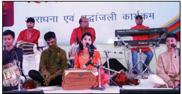
Ms. Maithili Thakur graced the bhajan sandhya ceremony

On 13 November 2019, Swami Rama Himalayan University (SRHU) and its promoting society Himalayan Institute Hospital Trust (HIHT) together observed 23 rd Mahasamadhi Anniversary of the founder and guide His Holiness Dr. Swami Rama. Hon'ble Chief Minister of Uttar Pradesh Yogi Adityanath, Dr. Dhan Singh Rawat, Minister of State for Higher Education, and Acharya Mahamandaleshwar Swami Awadheshanand Giri Maharaj of Bharat Mata Mandir were some of the esteemed guests at the annual ceremony.