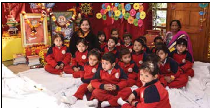
Saraswati Pooja observed on SRHU campus January 29, 2020