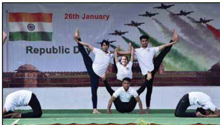
SRHU Republic Day celebration January 26, 2020